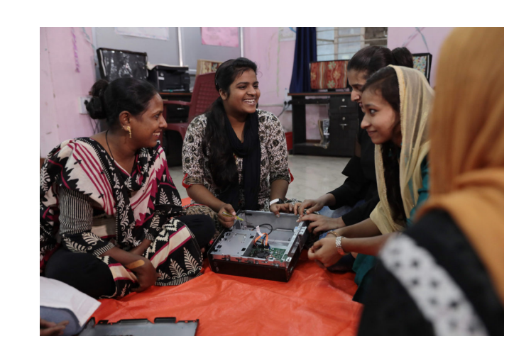
Support efforts to ensure an open, globally-connected, secure, and trustworthy Internet.