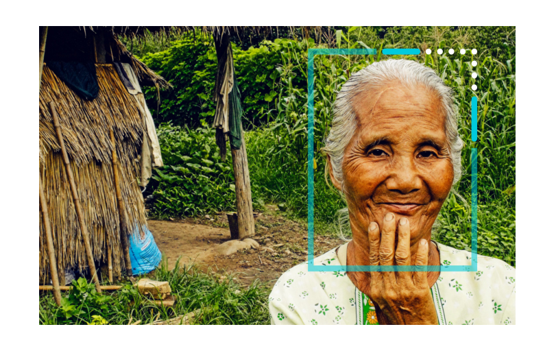
Advance the vision of the Internet Society: The Internet is for Everyone.