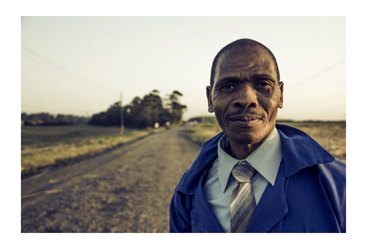
Fund initiatives that strengthen the Internet in function and reach so it can effectively serve all people.