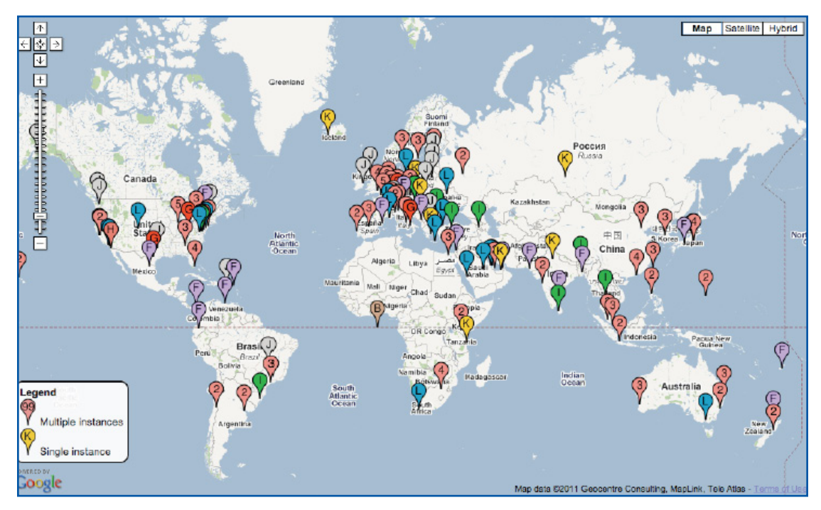
Figure 4 Global Root Server Distribution

In Figure 4 ("Global Root Server Distribution"), geographic distribution of the root name servers is shown with color-coding indicating the different organizations managing the root name servers. Considerable care has been taken in the design and deployment of the root name servers to minimize the risk of failure.