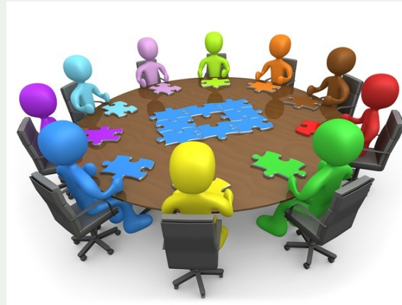
ISOC Board of Trustees