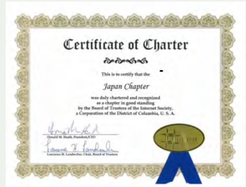
Certificate of Charter in 1994