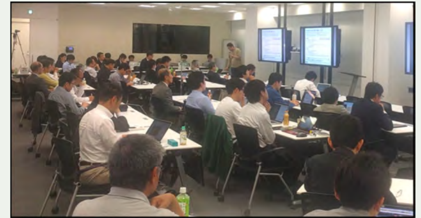
IETF 101 update meeting