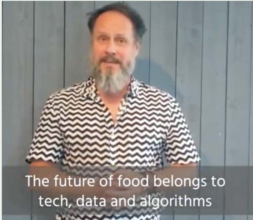
Internet of Food SIG: "What Is For Dinner?" Video