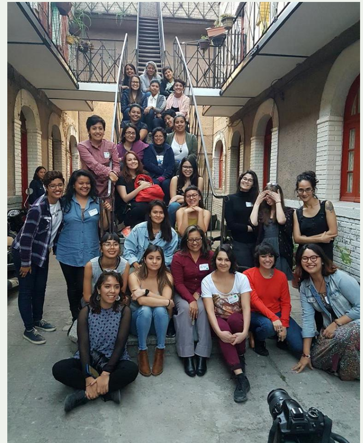
Women SIG Event in Mexico