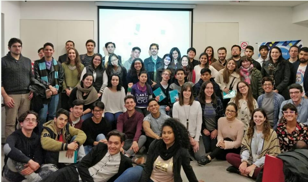
Youth SIG @LACIGF