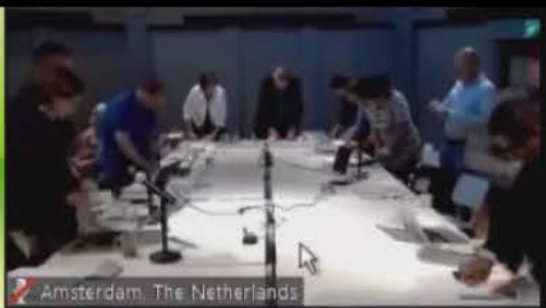
Amsterdam, The Netherlands