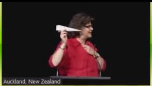
Auckland, New Zealand