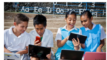
The future of Pacific Internet