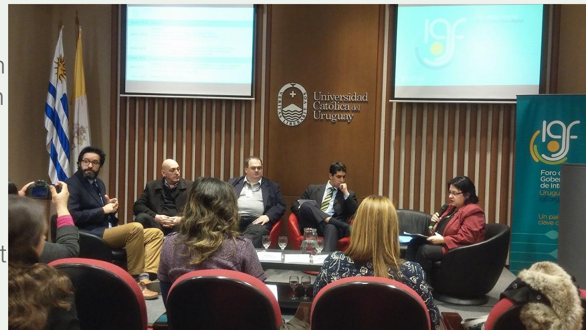
ISOC Uy IGF

The Argentina Chapter organized the first Argentinian School of Internet Governance of the country..