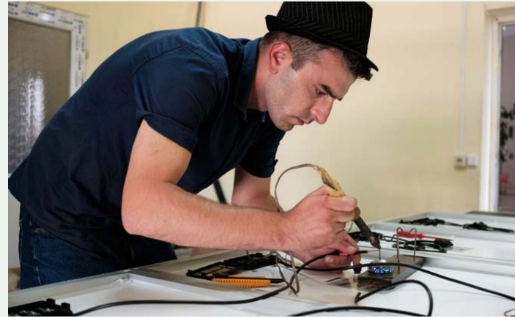
Community network Georgia