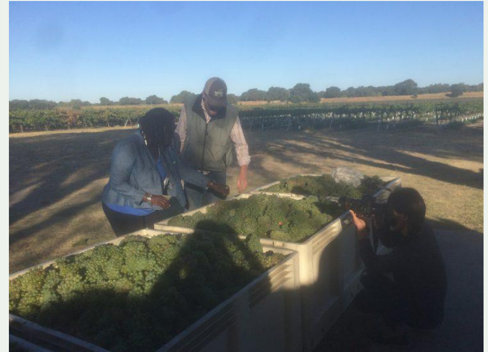
SF-Bay Area Project