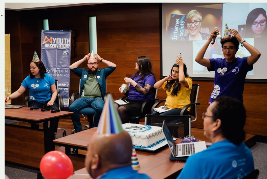
ICOMM17 Youth SIG