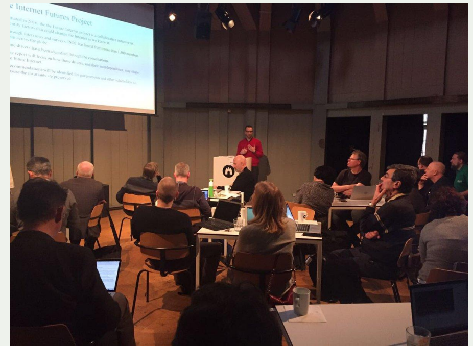
European Chapters Workshop, Amsterdam