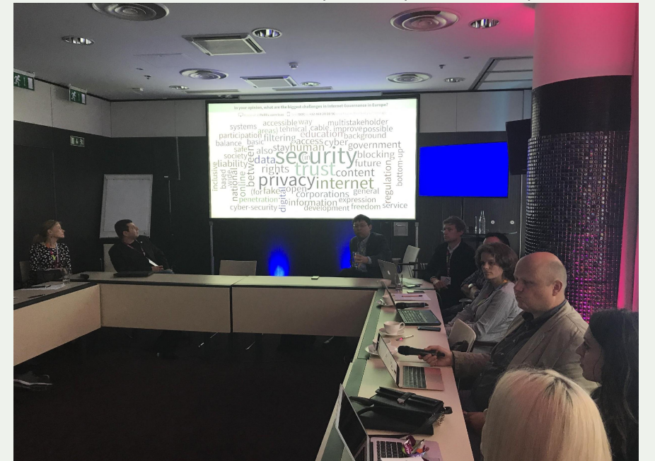
EURODIG Chapters&amp;Members Meeting