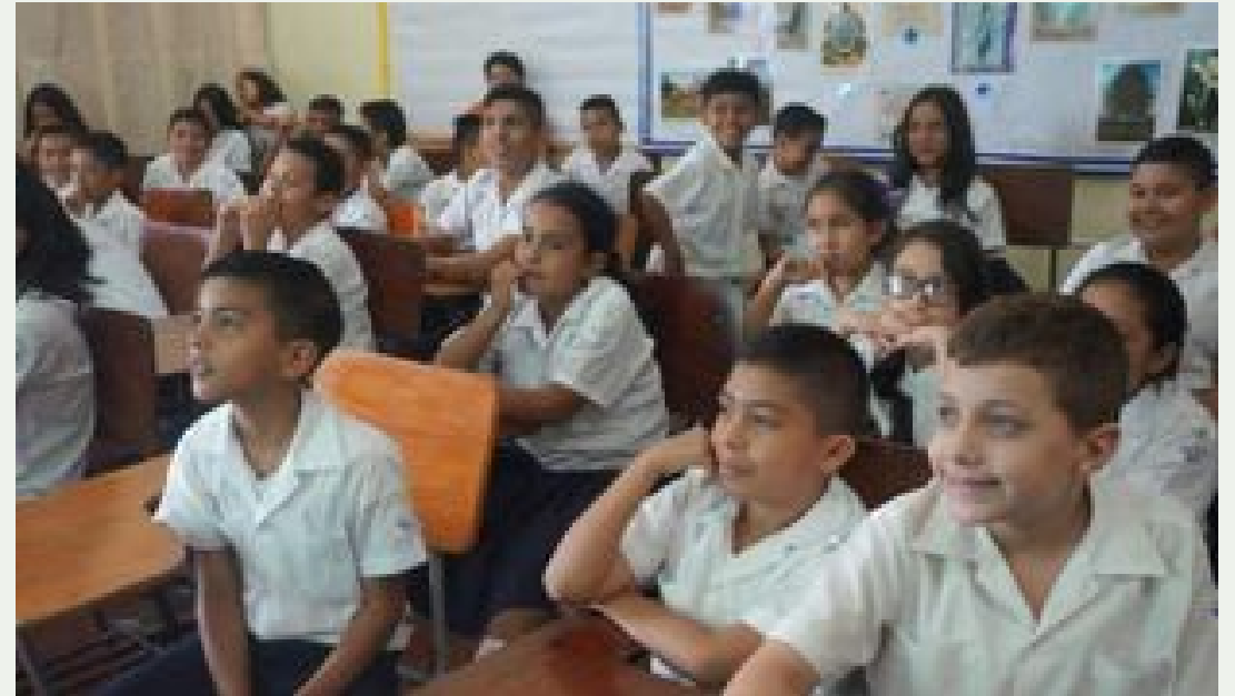
The Honduras Chapter at schools

The Paraguay Chapter develops a project to improve the Internet access of the National School of Lambaré (CNL).