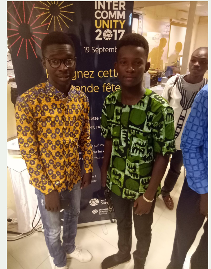
Burkina Faso ICOMM17