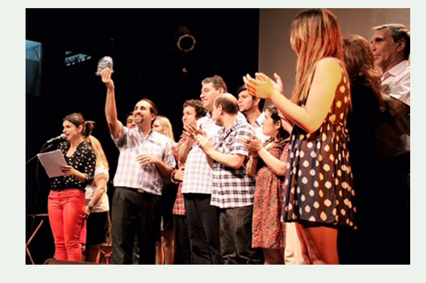
Tiflolibros UNESCO Prize (Argentina Chapter)