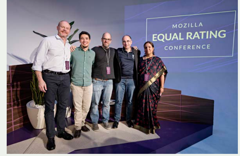
Zenzeleni Networks Mozilla Prize (South Africa Gauteng Chapter)